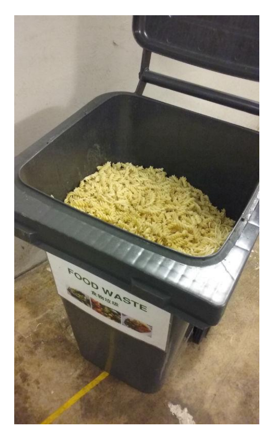
Food waste from central kitchen.