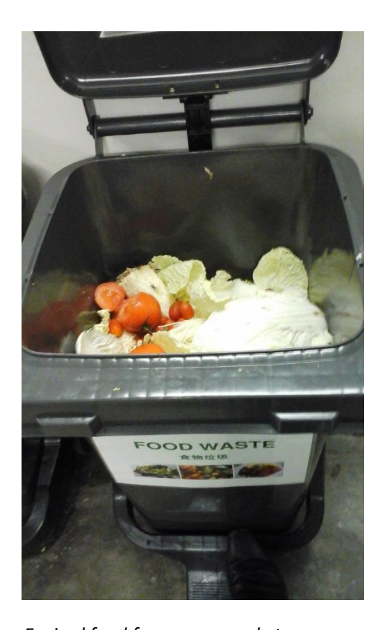
Expired food from supermarket