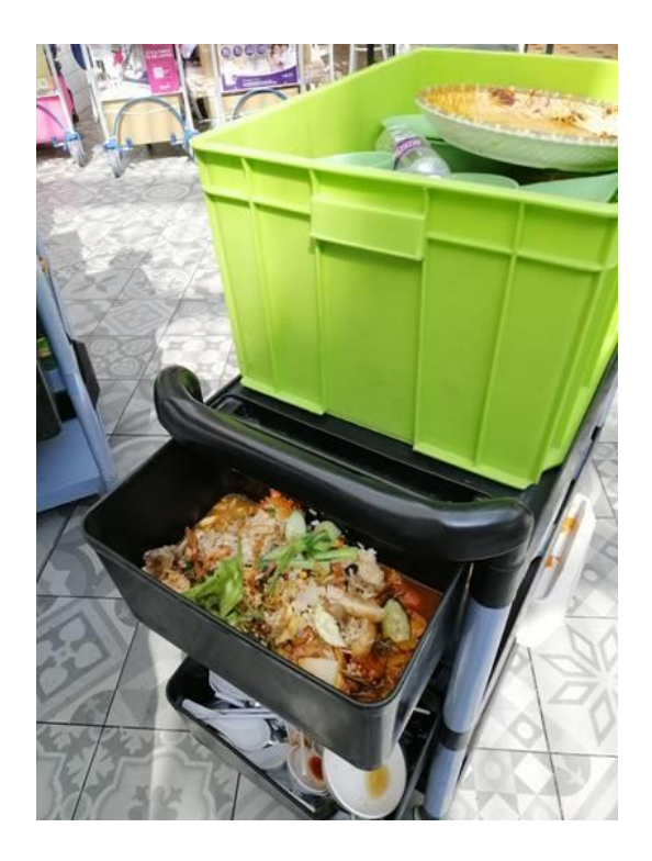
Plate waste sorted on a dish collection trolley