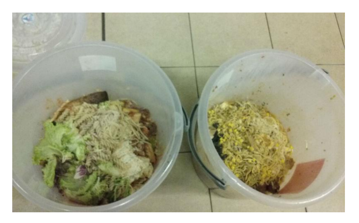
Plate waste collected from Restaurants